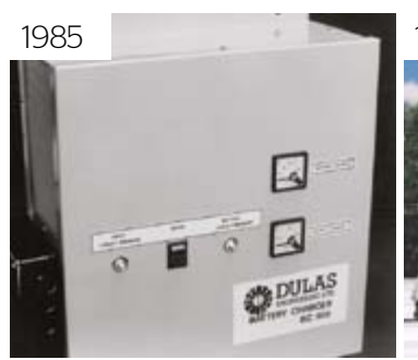
Solar powered battery charger (BC600). Hybrid system developed for a hospital with equipment for a school to power lights,

Even as a company we are a little different. Dulas is an employee-owned organisation and that shareholder commitment brings extra responsibility to build lasting relationships with our customers and to deliver great service with a personal touch.