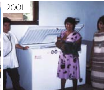
Dulas solar vaccine fridge systems in use