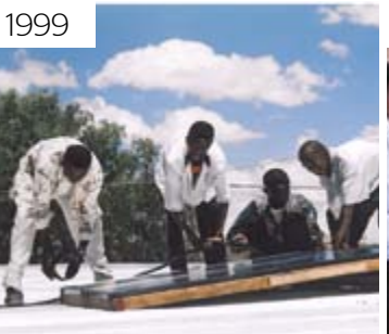
Somalia - we provided solar generating ability to operate via solar and grid-connect. an inverter and power for the science room