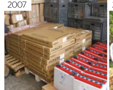
provide lighting, radio communications and in Laos. satellite in times of crisis and no power